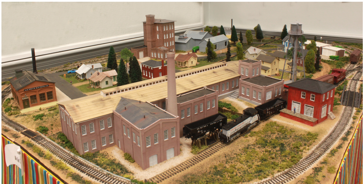
Model on display at the Cotton Mill Museum

Although located within a very easy walk of downtown Edenton, the Cotton Mill was much more than just an industrial site. It was a little village unto itself. All the attributes existed, from its baseball team competing in regional games to local community cookouts and neighborhood churches.