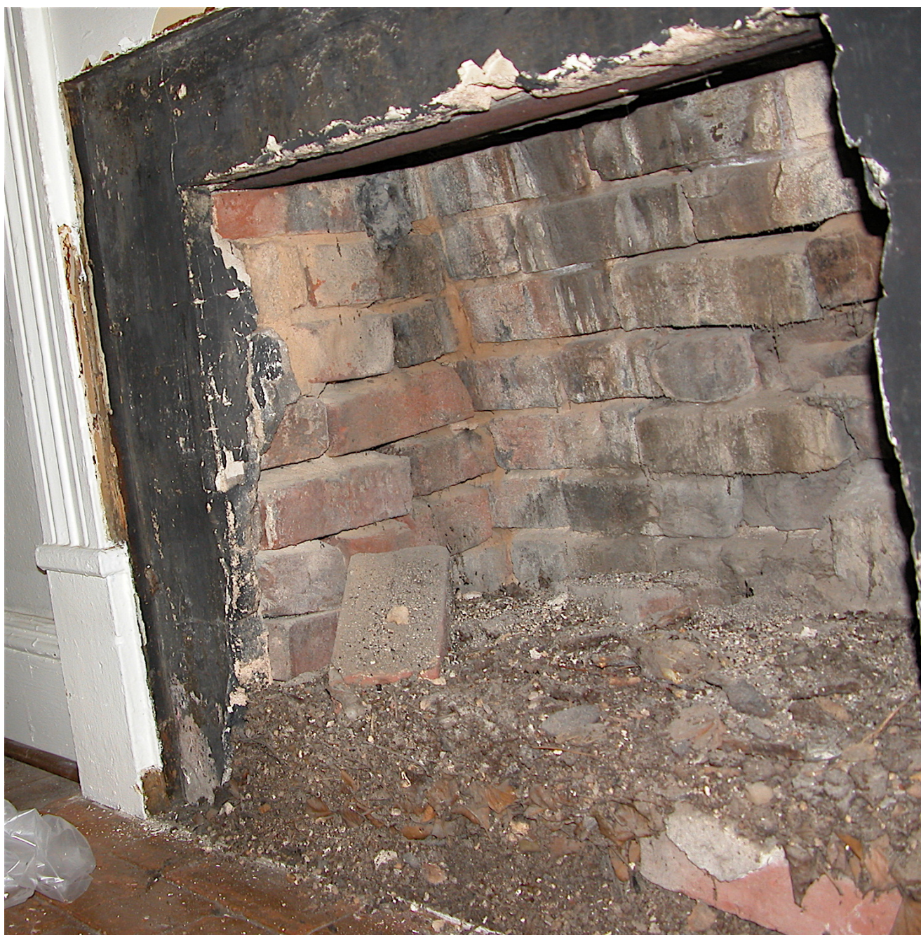
Fireplace before repair